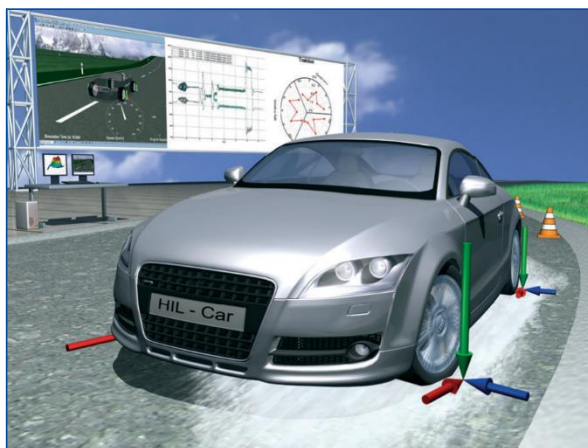
Vehicle dynamics analysis in virtual test drives